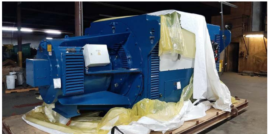
Unwrapping of the Turboden generator

Construction safety and safety around COVID-19 remain a priority on the construction site and will continue to be navigated as the project moves on.