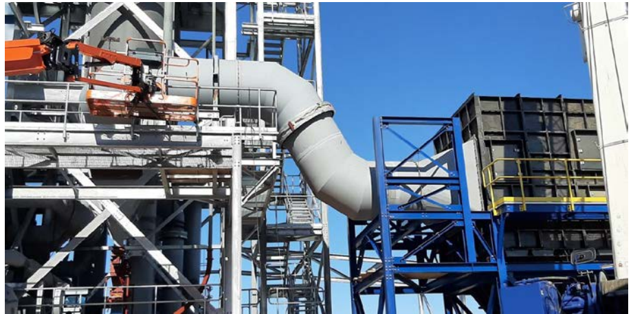
Cyclone ducting work completed in March 2021