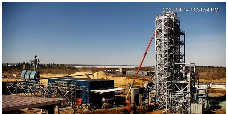
Site progress photo – April 14, 2021

For daily construction updates Click Here Like us on Facebook at MLTC Bioenergy Centre